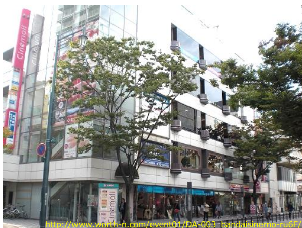
Bandai Cinemall Building (“KURANOMA” is on 4th floor)