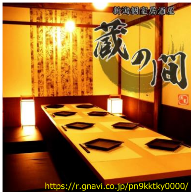
The Venue KURANOMA 蔵の間 (4F, Bandai Cinemall Building)

4F, Bandai Cinemall Building, 1-3-1 Bandai, Chuo-ku, Niigata, 950-0088