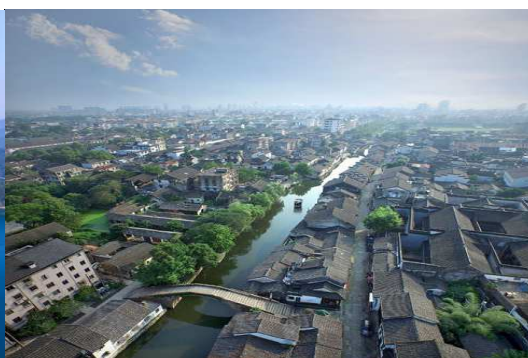
Nanxun Ancient Town, Abundant of natural and artificial scenic attractions