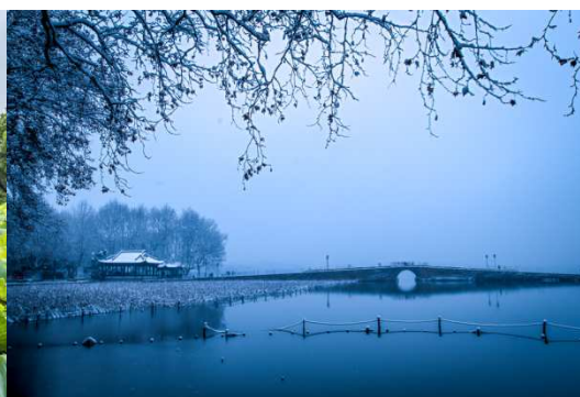
West Lake, Melting Snow on the Broken Bridge