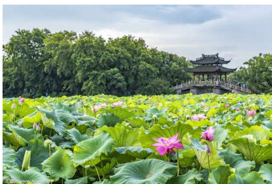
West Lake, Wine-Making Yard and Lotus Pool in Summer