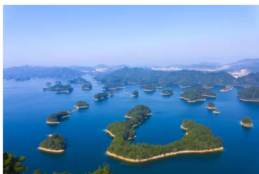
Thousand Island Lake, The first beautiful water in the world