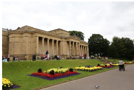
All the visitors also enjoyed the beautiful view outside the Museum, where there are a wide range of beautiful flowers and plants.