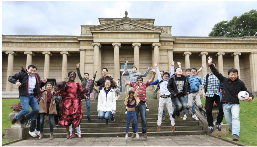
THE 3RD EVENT OF THIS STUDENT BRANCH CHAPTER